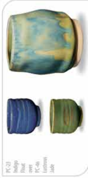
PC-23 Indigo Thick over PC-46 Lustrous Jade