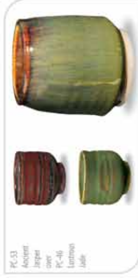
PC-53 Ancient Jasper over PC-46 Lustrous Jade