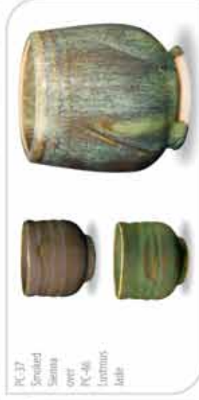
PC-37 Smoked Sennas over PC-46 Lustrous Jade