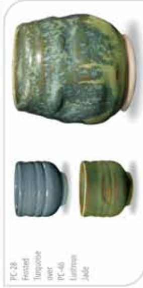
PC-38 Fronted Tungus over PC-46 Lustrous Jade