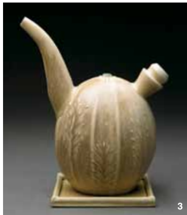
1 Tyler Gulden's teapot, 7 in. (18 cm) in height, soda-fired porcelain, 2014. 2 Ellen Shankin's Nested Soy Bottle , 4 in. (10 cm) in height, stoneware, 2014. Photo: Tim Barnwell. 3 Marlene Jack's oil pot, 8 in. (20 cm) in height, porcelain, 2014. "Pouring Arts Invitational 2015," at The Narrows Center for the Arts ( www.narrowscenter.org ), in Fall River, Massachusetts, through March 28. 4 Bob Green's Seed Pot , 6 in. (15 cm) in height, naked raku, 2013. "Of Earth," at Anchor Providence ( www.anchorprovidence.com ), in Providence, Rhode Island, March 21–April 5. 5 Adero Willard's Patchwork , 12 in. (30 cm) in height, terra cotta, sgraffito, slip trailing, wax resist, 2014. 6 Molly Cantor's Pail for Mary Webster , 10 in. (25 cm) in diameter, wheel-thrown and handbuilt porcelain, slip carving, wire, 2013. "The State of Clay: Pushing Boundaries," at Fuller Craft Museum ( www.fullercraft.org ) in Brockton, Massachusetts, March 7–May 24.