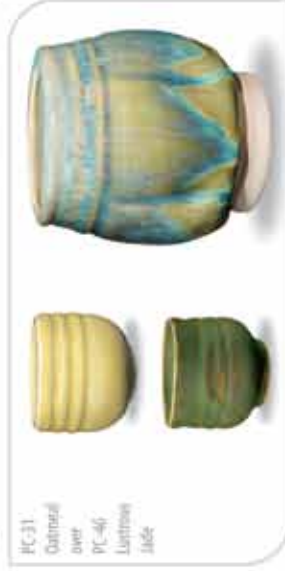
PC-31 Oatmeal over PC-46 Lustrous Jade