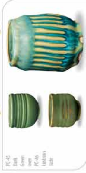
PC-45 Dark Green over PC-46 Lustrous Jade