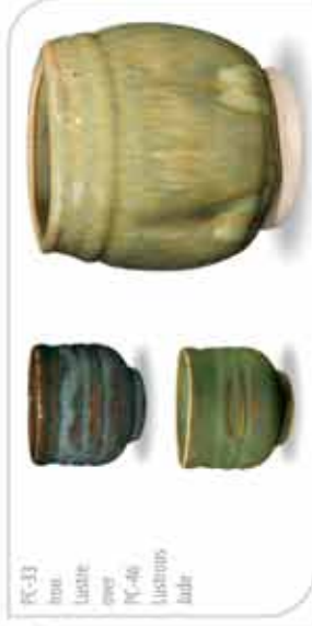
PC-33 Iron Lustrous over PC-46 Lustrous Jade