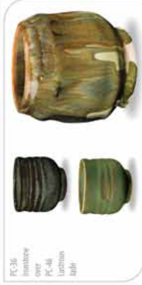
PC-36 Innert over PC-46 Lustrous Jade