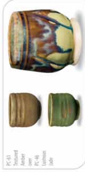
PC-51 Textured Amber over PC-46 Lustrous Jade