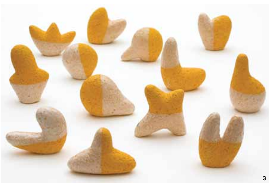
1 Allan Rosenbaum's Sluice , 3 ft. 5 in. (1 m) in width, epoxy clay, polystyrene, wire, 2013. Photo: Taylor Dabney. 2 Allan Rosenbaum's Muse , 34 in. (86 cm) in height, epoxy clay, polystyrene, 2014. Photo: Taylor Dabney. "Binary," at Mill Gallery ( www.pawtucketartscollaborative.org ), in Pawtucket, Rhode Island, March 25–28. 3 Rebecca Harvey's Orange Field , 24 in. (61 cm) in length, ceramic, 2014. "To Be Determined," at Pawtucket Armory ( www.pawtucketarmoryartscenter.com ), in Pawtucket, Rhode Island, March 25–28. 4 Nathan Willever's platter, 15 in. (38 cm) in diameter, red stoneware, 2014. 5 Kaitlyn Duggan's Bounty , 15 in. (38 cm) in diameter, red earthenware, majolica glazes, stains, 2014. "Maine College of Art Ceramics Alumni Exhibition," at ArtProv Gallery ( www.artprovidence.com ), in Providence, Rhode Island, March 10–April 3.