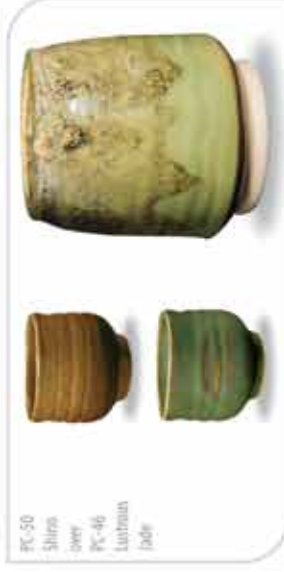
PC-50 Shiro over PC-46 Lustrous Jade