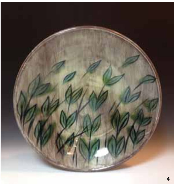
1 Allan Rosenbaum's Sluice , 3 ft. 5 in. (1 m) in width, epoxy clay, polystyrene, wire, 2013. Photo: Taylor Dabney. 2 Allan Rosenbaum's Muse , 34 in. (86 cm) in height, epoxy clay, polystyrene, 2014. Photo: Taylor Dabney. "Binary," at Mill Gallery ( www.pawtucketartscollaborative.org ), in Pawtucket, Rhode Island, March 25–28. 3 Rebecca Harvey's Orange Field , 24 in. (61 cm) in length, ceramic, 2014. "To Be Determined," at Pawtucket Armory ( www.pawtucketarmoryartscenter.com ), in Pawtucket, Rhode Island, March 25–28. 4 Nathan Willever's platter, 15 in. (38 cm) in diameter, red stoneware, 2014. 5 Kaitlyn Duggan's Bounty , 15 in. (38 cm) in diameter, red earthenware, majolica glazes, stains, 2014. "Maine College of Art Ceramics Alumni Exhibition," at ArtProv Gallery ( www.artprovidence.com ), in Providence, Rhode Island, March 10–April 3.