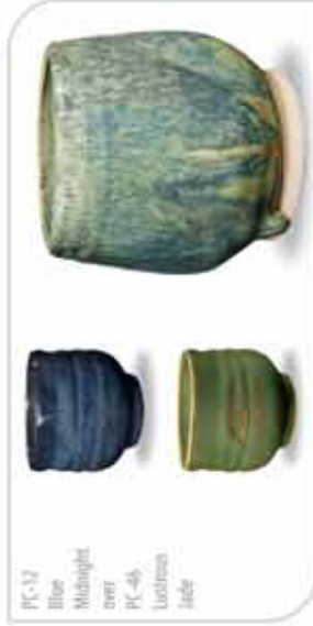
PC-32 Indigo Midnight over PC-46 Lustrous Jade